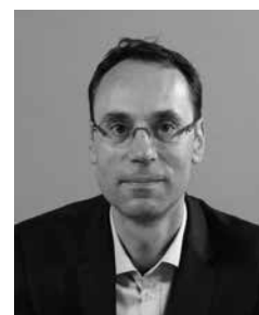
Guillaume Binet CL3: Digital Water Suez