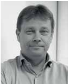
Ilari Aho Water Distribution Infrastructure UPONOR