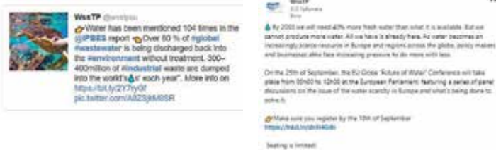
SOCIAL MEDIA FOLLOWERS