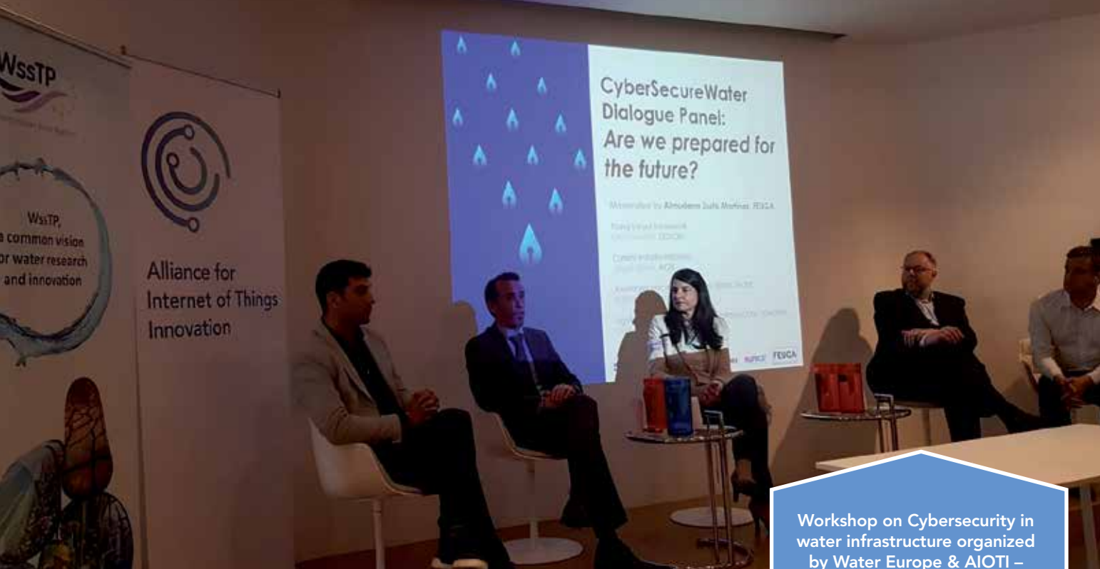
Workshop on Cybersecurity in water infrastructure organized by Water Europe & AIOTI – 28th of May, Barcelona - Spain