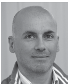
Gaetano Casale Water Beyond Europe IHE Delft