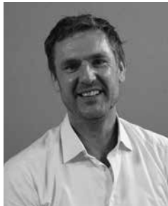
Victor Breumer CCL5: Hybrid Grey- Green Infrastructure Deltares